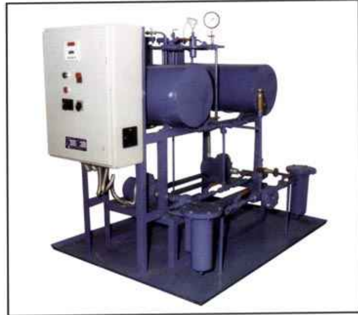
FURNACE OIL HEATING PUMPING FILTERING UNIT