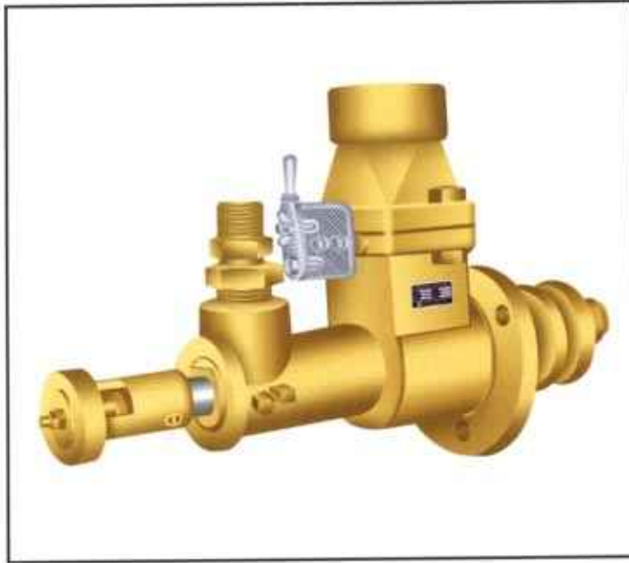
LOW AIR PRESSURE OIL/GAS/DUAL FUEL BURNERS